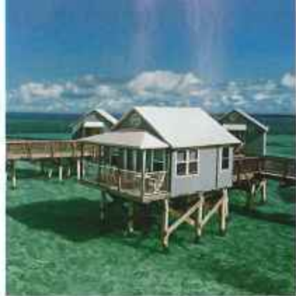
9 Beaches, Bermuda

> The dramatic rolling green hills paint the picture already in your mind. As your ferry docks at Inishmore island off the western coast of Ireland, the real hills appear. Just being here seems like enough, but then you check into one of the five king rooms with balconies at the Aran Islands Hotel, the only hotel on this tiny gem of an island. Immediately open your window (even if it's wet and rainy). Panoramic views from Connemara to Clare are visible on a clear day. Thousands of miles of stone walls, built by hand over hundreds of years, meander atop the entire island. And when you just can't take it anymore, experience the view firsthand by walking this ciúna gan uaigneas (silent but not lonely) island. Dún Aonghusa fort has been sitting just a few miles from your window since the late Bronze Age. This is history only few see — and it's right outside your window. Rates from $70. aranislandshotel.com